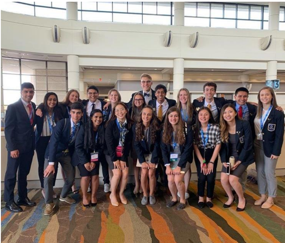
DECA International Career Development Conference 2019

I love to work out, swim, and walk my dog Mia! All of my friends know that I am absolutely obsessed with my dog and spend all my spare time taking her to crazy places.